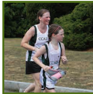
CCALS runners young and old