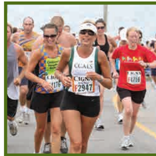
A CCALS runner leading the pack