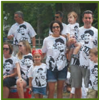
CCALS supporters cheering the runners along the route

Our Facebook community is rapidly growing. Stay up to date on all CCALS events and workshops by adding us as a friend or joining our cause.